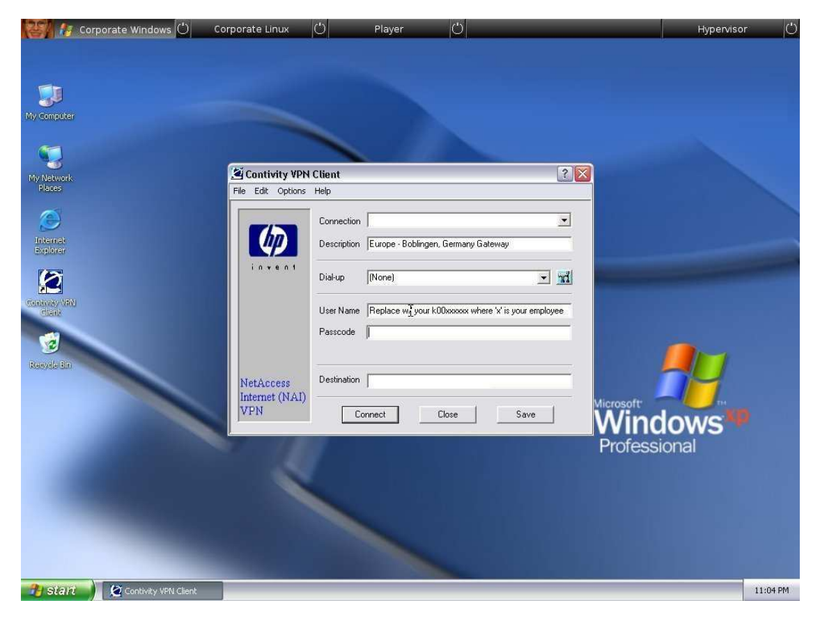
Fig. 4: OpenTC with its status bar and a compartment running Windows XP.

Fig. 3: OpenTC taskbar (cropped) with a red button indicating that the TCB is not in a known state and that unsealing the image has not been possible.